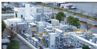
A demonstration plant installed on Kobe Port Island