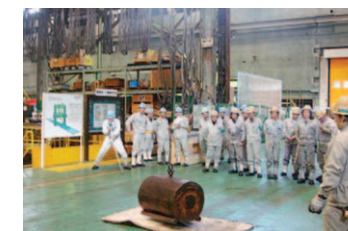
Education that simulates experiences of danger

By making employees understand the dangers in their workplaces through the use of simulated experiences of danger, we are seeking to raise safety awareness and striving to prevent occupational accidents that are caused by unsafe behaviors. Furthermore, we are installing more devices and facilities to achieve more efficient education that simulates experiences of danger.