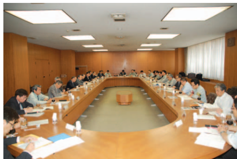
Central Management Consultation Committee

We believe that it is important for top managers to share their thoughts, guiding principles, and information about management and other matters with all employees as soon as possible in order to create a lively and vital workplace environment. We use our intranet and internal bulletins to share information in a timely manner and to ensure dissemination of messages from top managers. We strive to ensure that correct information is transmitted to everyone by providing a variety of opportunities for consultations between labor and management, where managers can explain their guidelines and management information. Yet it is also important for requests and other communications to be transmitted from employees to managers. Here, too, consultations between labor and management allow labor unions to convey employees' wishes and opinions. In addition, we conduct surveys of employee satisfaction every other year and use the information when considering policies and actions.