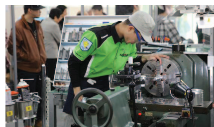
Technical Skill Grand Prix

Our production professionals are also active participants in the Technical Skill Grand Prix and other outside technical skill competitions.