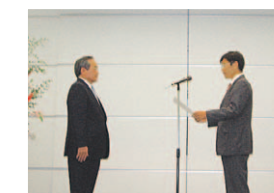
The Hyogo Labor Office Director's Award (medal)

These efforts are not only applicable to childrearing. Similar programs are available to employees with elderly or ill family members who require home care, and we provide many kinds of support for maintaining a balance between working and caring for family members.