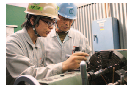
Passing along skills through reemployment of retired employees

Even after retirement, employees may, if they wish, take advantage of our Post-Retirement Reemployment System and be re-employed until the age of 65. Implementing this system allows many older people to make use of their wealth of experience, pass on their skills, and engage in practical work.