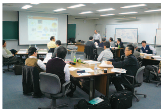
Training for General Managers

When it comes to carrying out everyday operations, we make use of communication, especially the Operational Goal Sharing Program (GMK, which stands for the Japanese words Gyomu mokuhyo kyoyuka), semi-annual face-to-face discussions between supervisors and subordinates, in order to develop skills through achievement of operational goals.