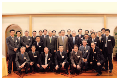
Associate Officers with the President and Vice-president at the center