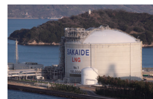
Sakaide LNG Terminal