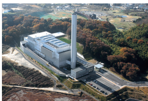
Refuse incineration plant (Hirakata City, Osaka Prefecture)