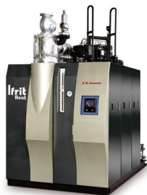
Ifrit-Beat Drumless Water Tube Boiler

* Turndown: A ratio between a burner's maximum and minimum firing rates that can be controlled