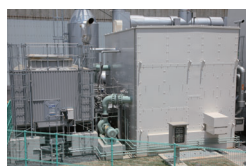
Binary power generation system