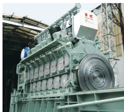
Kawasaki Green Gas Engine

A small binary power generation system (250 kW) developed by Kawasaki began proving operation in May 2010, using heat exhaust from an independent power generation facility utilizing a 5,000 kW-class Kawasaki Green Gas Engine installed at the Kobe Works. A binary power generation system is an energy conserving system that recovers energy from previously unused lower-temperature heat sources, such as heated effluent and exhaust gas, to run turbine generators and create electric power. Because it uses substitute fluorocarbons with low global warming potential and ensures that heat exchangers work at high performance, the compact system is eco-friendly and efficient.