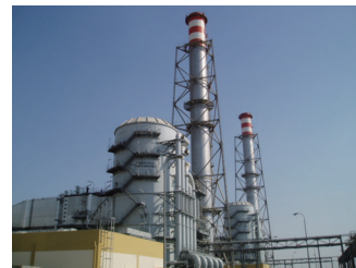
Flue gas de-SO x system (Saudi Arabia)