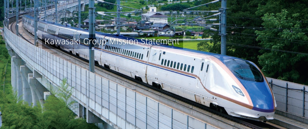
Kawasaki Group Mission Statement