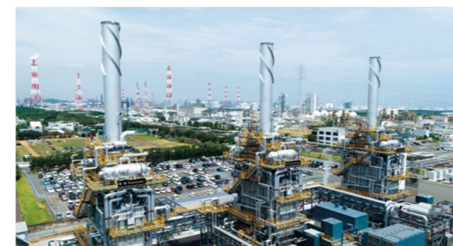
100 MW-class combined cycle power plant developed by Kawasaki