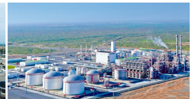
Gas-to-gasoline (GTG) plant